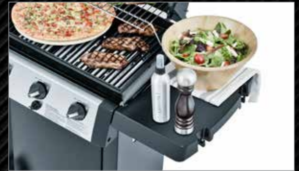
DURABLE RESIN SIDE SHELVES