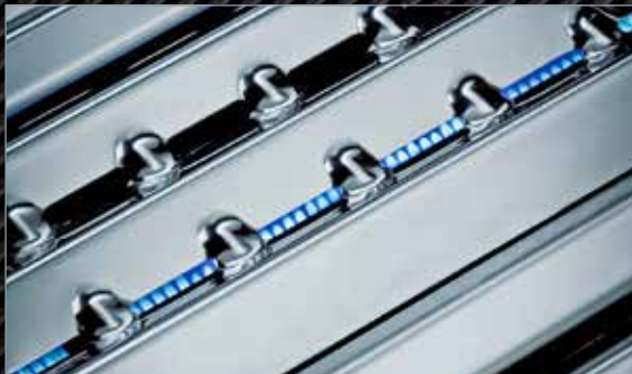
STAINLESS STEEL FLAV-R-WAVE™