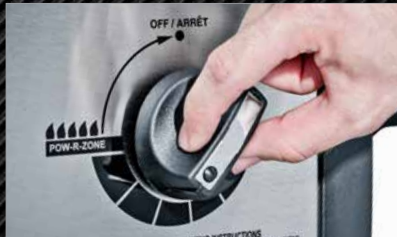
180 DEGREE CONTROL